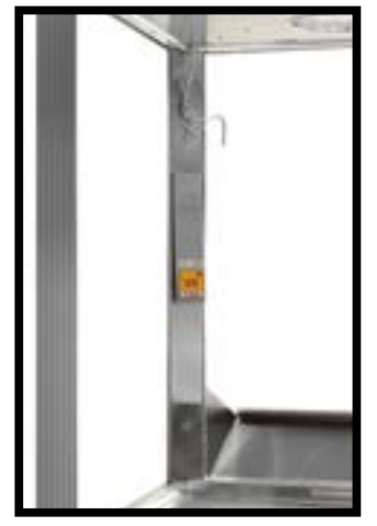
Popit N' Topit