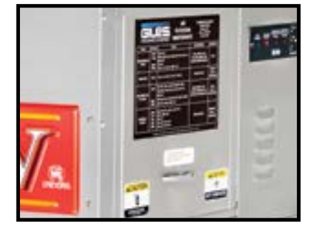
Close-up of Ventless Feature